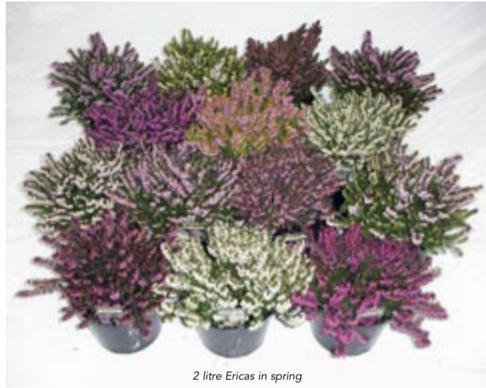
2 litre Ericas in spring