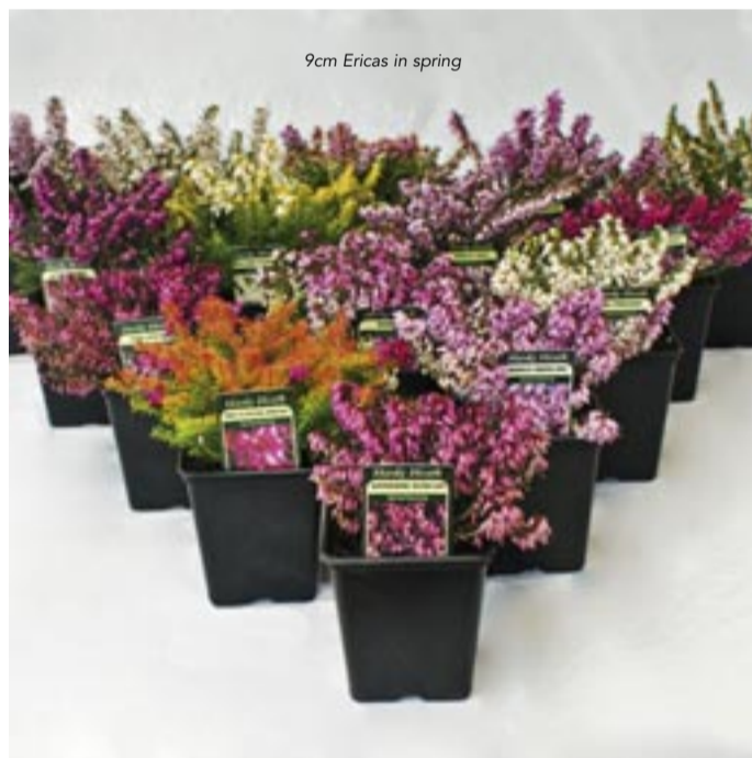
9cm Ericas in spring

We have a good range of well budded Ericas available in all pot sizes. Even if sales slow down, these plants are fully hardy and will continue to look good through the winter and into the spring.